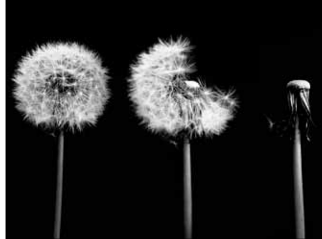
Betsy Arce - Allen HS (Allen) - First Place Landscape/Nature - Top Program