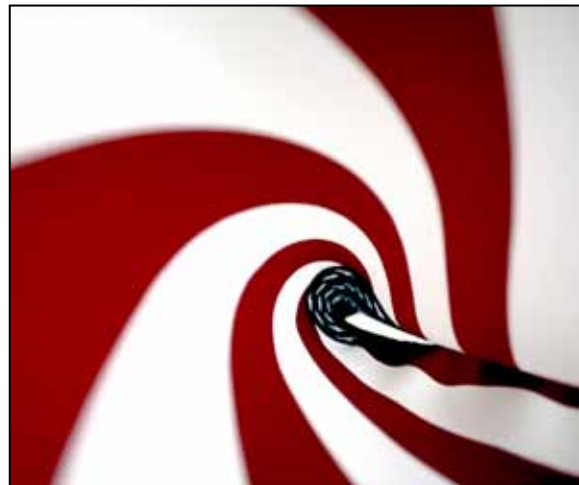
Cody Garcia - Deer Park HS (Deer Park) - HM Still Life - Top Program