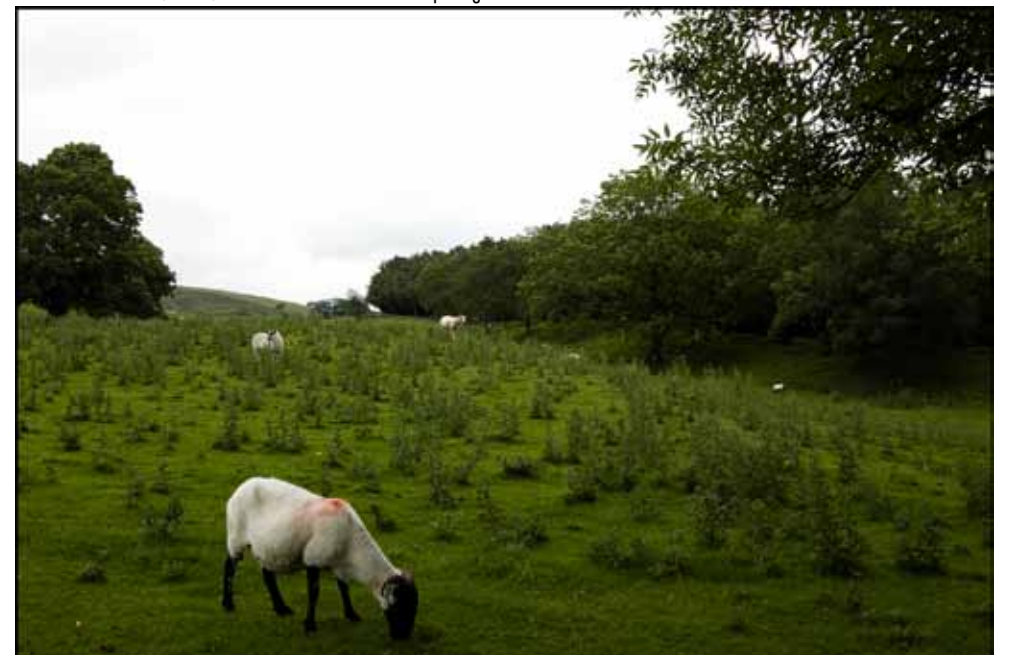
Jack Silverman - Greenhill School (Addison) - First Place Landscape/Nature - Top Program