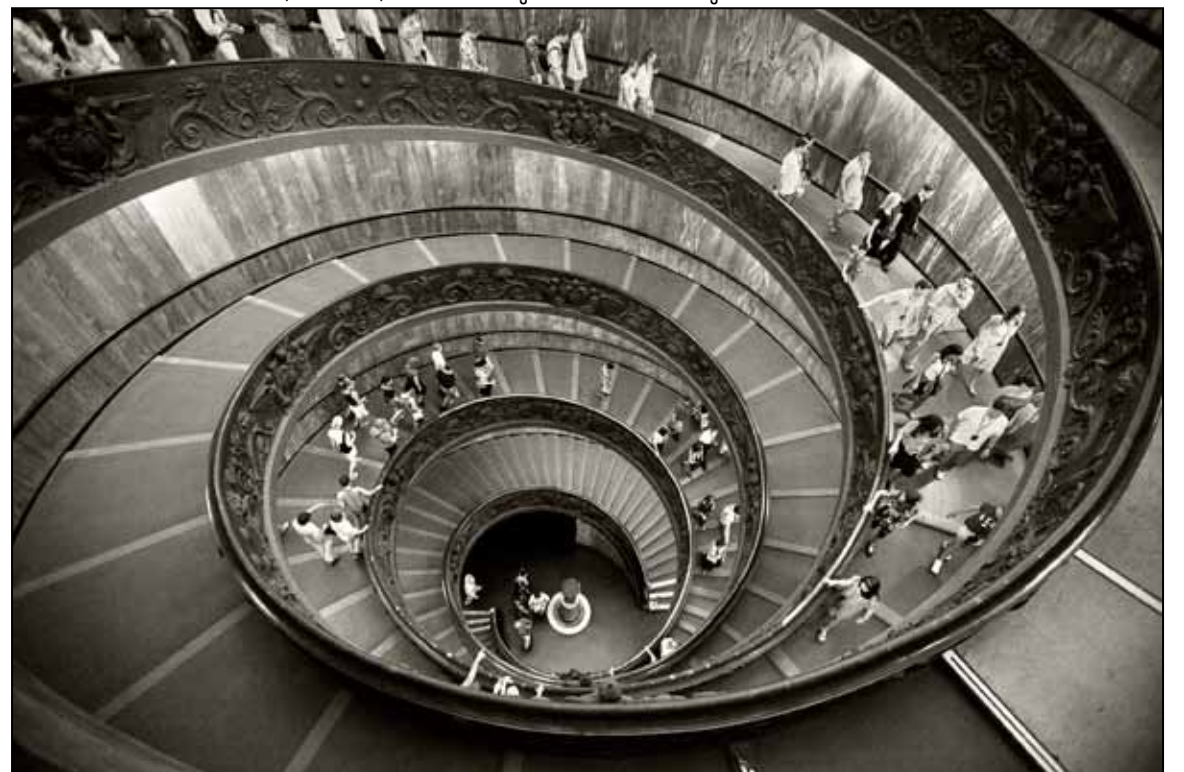
Getty Hall - St. Mark's School of Texas (Dallas) - First Place Architecture - Top Program