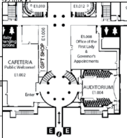
FIRST FLOOR below ground level