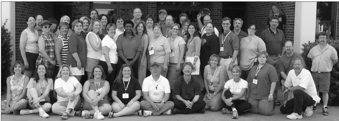
The gang poses for the traditional end-of-the-workshop group photo. The 37 teachers, who came from all over Texas as well as Virginia and California, comprised one of the largest groups in the 10-year history of the workshop.