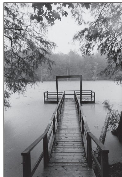
This photo by Christina Holcomb, Cy-Fair HS - Houston, was part of the Second Place Landscape/Nature portfolio. The portrait was part of Cy-Fair's

The ATPI Top Program contest consists of eight individual portfolio competitions. Schools enter 10-print portfolios into four of the eight categories - architecture, digital, documentary/photojournalism, landscape/nature, portrait, sports, still life and thematic. Each portfolio represents the work of at least five students. Schools are awarded points based on first, second, third or honorable mentions in each contest. The school with the greatest number of points after all eight contests is named the Top Program for the school year.