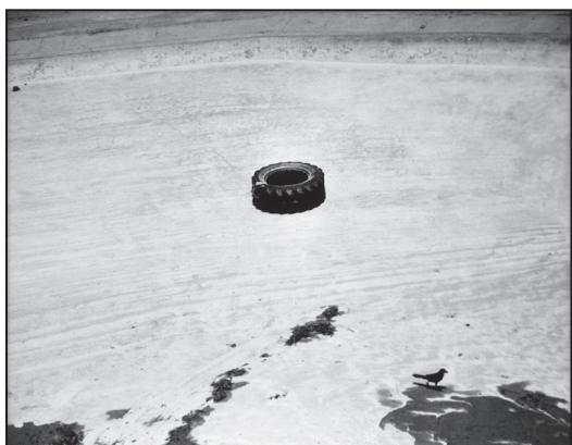
Gwen Kelly, Fort Worth Country Day School, Fort Worth - First Place Still Life portfolio - 2006 Top Program contest

Association of Texas Photography Instructors P.O. Box 121092 Arlington, TX 76012