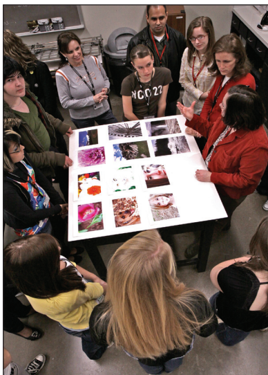
Students participate in a Beginning Portfolio Review at the 2008 Winter Conference. Students bring in up to five mounted or unmounted images and receive a critique from a photography teacher or one of the speakers. Advanced students may also register for Portfolio Reviews (page 5) but must have 5-10 mounted prints.