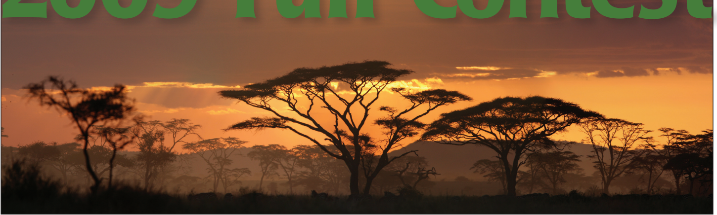
First Place Adv Landscape - AMY DOGGETT - The Kinkaid School