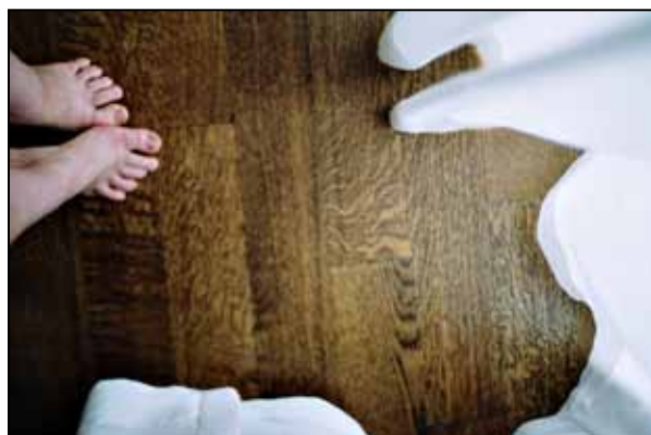
Leila Farhood First Place Fine Art