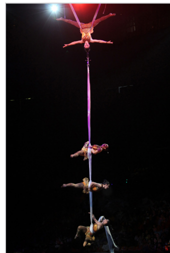
Third Place Photojournalism- Hal Fulgham- Chang Park • Trinity High School (Euless)

The system cost ATPI $8,000 to develop. After the first year, ATPI can allow other organizations to use the system.