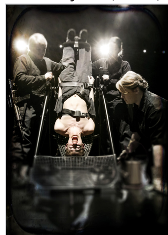
Second Place Thematic- Top Program- Name • Texas High School (Texarkana)