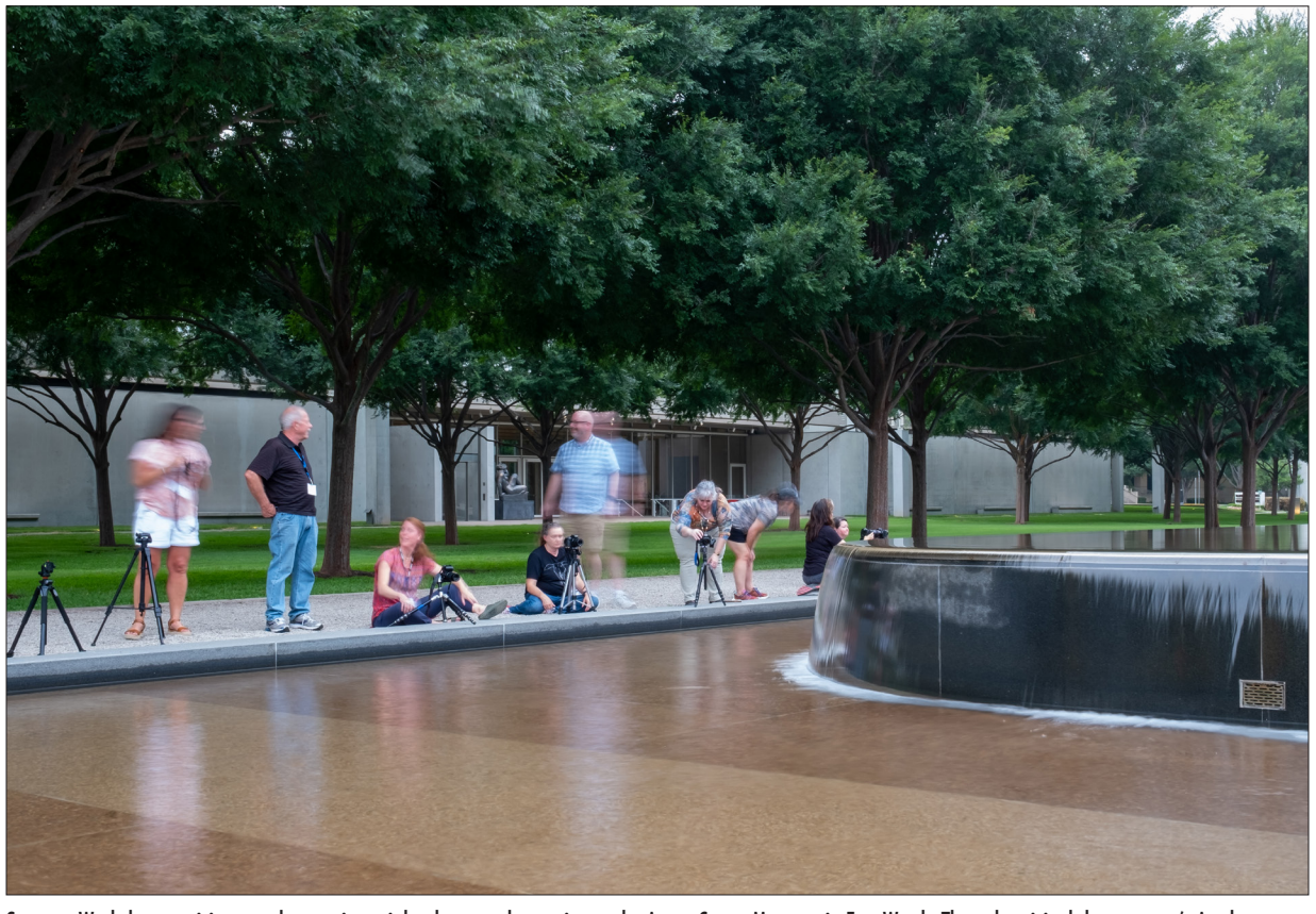
Summer Workshop participants take part in a night photography session at the Amon Carter Museum in Fort Worth. They also visited the museum's Avedon exhibition, which is on view through Oct. 1.

Volume 32 ◆ Issue 1 September 2023 A publication of the Association of Texas Photography Instructors