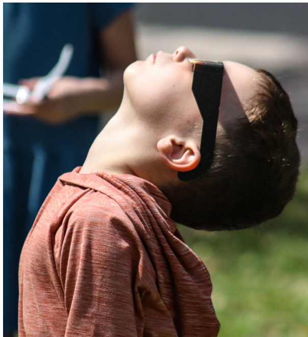
A student cranes his neck back to view the eclipse at Abilene Christian School on Monday, April 8, 2024.

As part of the eclipse on April 8, 2024, ATPI sponsored an eclipse contest for students and teachers. Judging for those entries is still being completed, but here are a few images from that day.