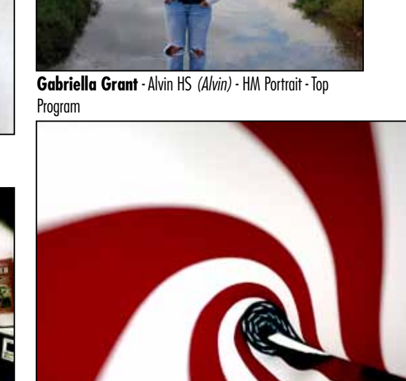
Cody Garcia - Deer Park HS (Deer Park) - HM Still Life - Top