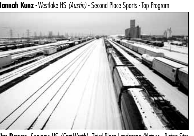
Documentary/PJ - Top Program

Emily Hom-Nici - Allen HS (Allen) - Second Place