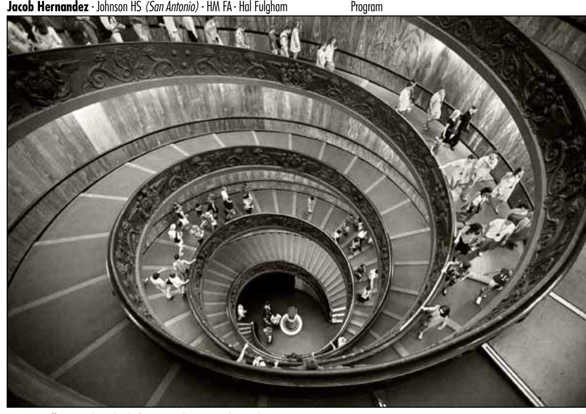
Getty Hall - St. Mark's School of Texas (Dallas) - First Place Architecture - Top Program