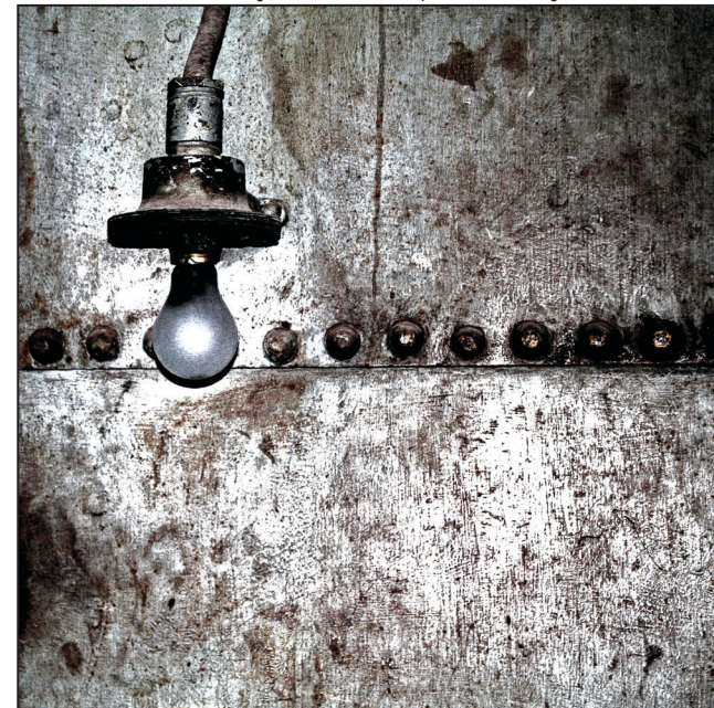
Brianna Smelley - Deer Park HS (Deer Park) - Second Place Still Life - Top Program