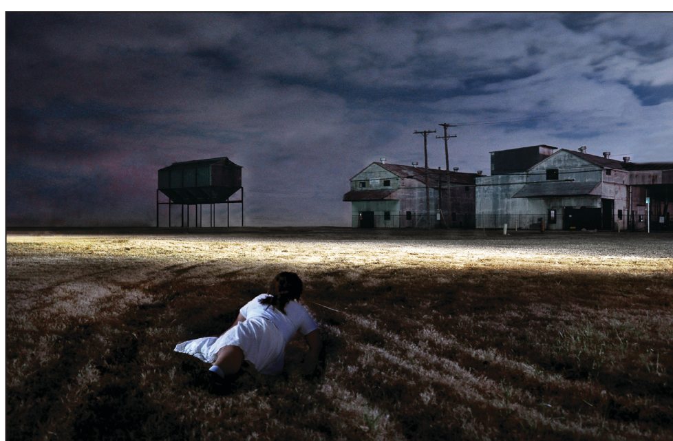
Adoree Del Toro-Garcia - McCallum HS (Austin) - First Place Landscape/Nature - Rising Star