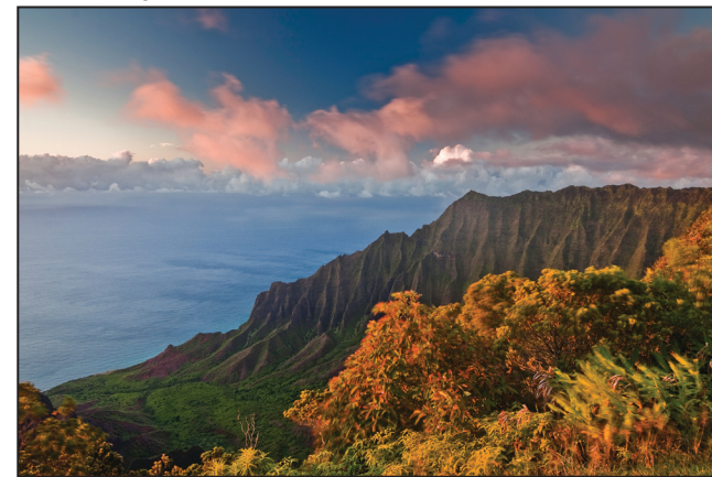
Jonathan Vail - Austin HS (Austin) - First Place Landscape/Nature - Top Program