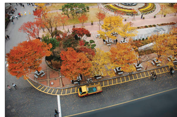
Yanghyun Park - Trinity HS (Euless) - Honorable Mention Landscape/Nature - Top Program