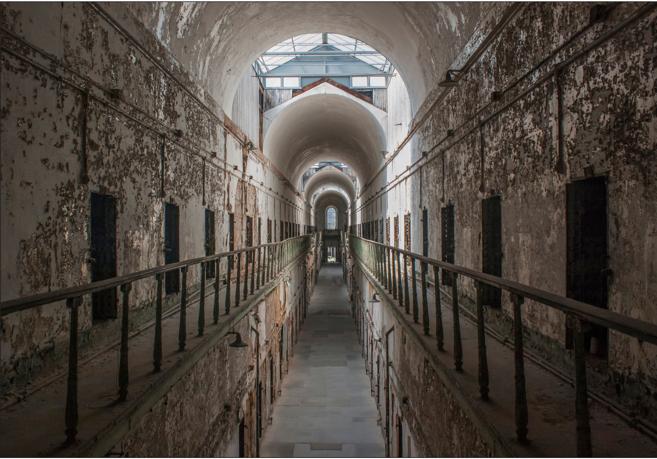
Abigail French - Allen HS (Allen) - Third Place Architecture Portfolio Top Program - Instructor: Krista Luter